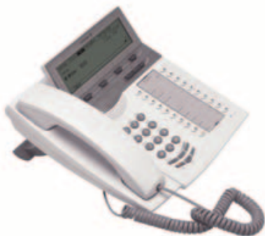
Dialog 4425 IP Vision

Depending on your requirements, various options are available for call-group supervisors and agents, including Call Center Manager and Agent Desktop applications. The call center solutions