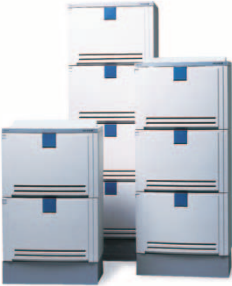
MD110 may be built with one to four stackable modules, placed side-by-side or back-to-back.