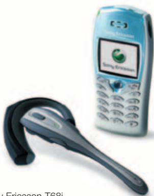
Sony Ericsson T68i