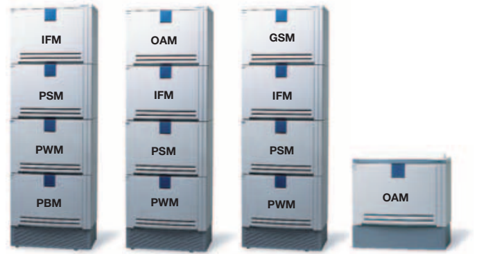
The illustration shows an example of how the stackable modules can be arranged for a 3-LIM exchange.

from Ericsson Enterprise are the traditional MD110 call center and the state-of-the-art contact center Solidus eCare™.