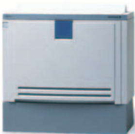
MD110 is prepackaged for small to medium-sized companies and branch offices.